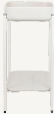
CUBE BASIN STAND