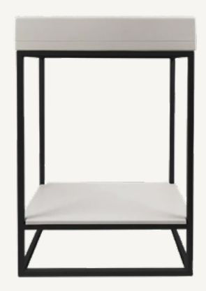
BOX BASIN VANITY SET