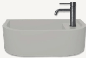
LOOP 01 BASIN