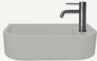
LOOP 02 BASIN