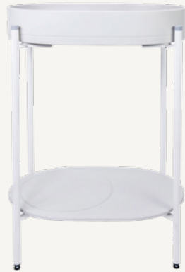
PILL BASIN STAND